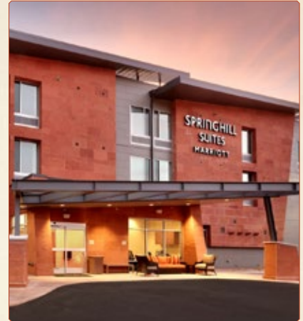
Located 5 miles from Arches National Park and 2.5 miles from downtown Moab, SpringHill Suites by Marriott is the meeting location for your expedition. Having your own transportation to grab dinner in town, or last minute items is recommended.