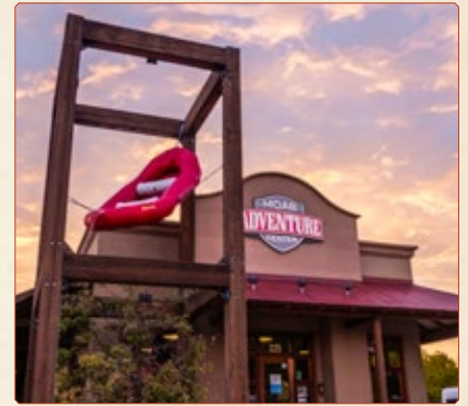
Western's Moab Adventure Center, 225 South Main.

The early morning start of these 3 hour tours may allow time for other adventures in the day.