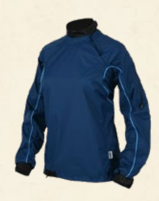
Key Feature: Neoprene rubber "gaskets" around wrists & neck. Best in cold weather & whitewater.